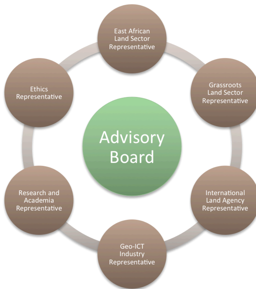
Figure 1. its4land AB membership groupings

The primary groups include: East African Land Sector (including both smallholder and government interests); the Global Grassroots Land Sector (including NGOs, not-for-profit, and civil society organizations); the International Land Sector (including UN agencies, and professional bodies, and donors); the global Geo-ICT industry; and Research and Academic Community (encompassing both interests in ICT and land administration research interests); and the ethics/technology community (Figure 1). Therefore, the AB consists of 5 members. Arguments can be made for separating several of the broad groupings and creating a larger AB membership. For example, the International Land Sector could be broken into donor interests and professional body interests. However, the MT decided a trade-off between full stakeholder representation and AB effectiveness needed to be struck – and consequently 6 seats were established.