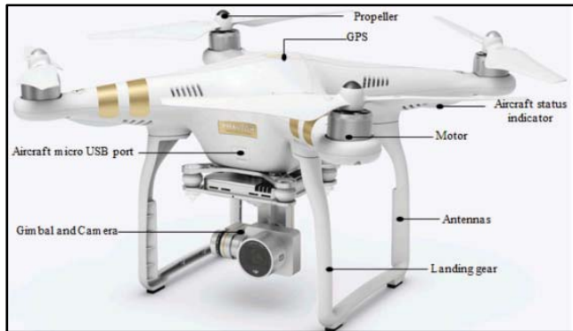
Figure 1: Shows a DJI Phantom Multi-rotar Drone/ UAV