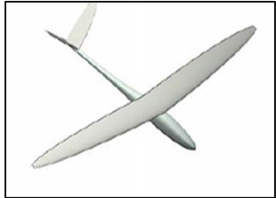
Figure 2: Shows a DT-18 Fixed Wing UAV from Delair-Tech